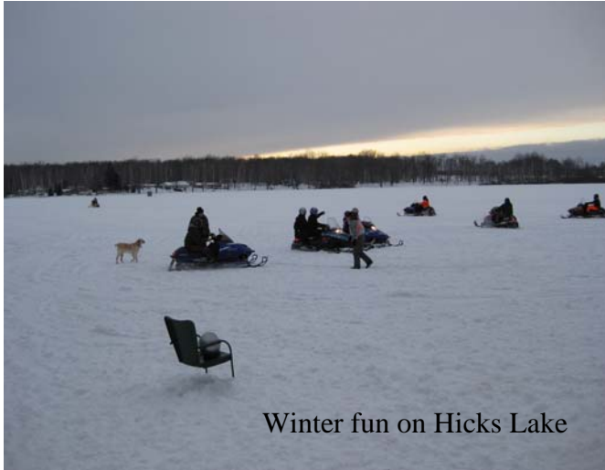
Winter fun on Hicks Lake

With the spring season very close we thought it a good time to send out a newsletter and update all of the residents on the weevil project and other bits of pertinent information about the lake.